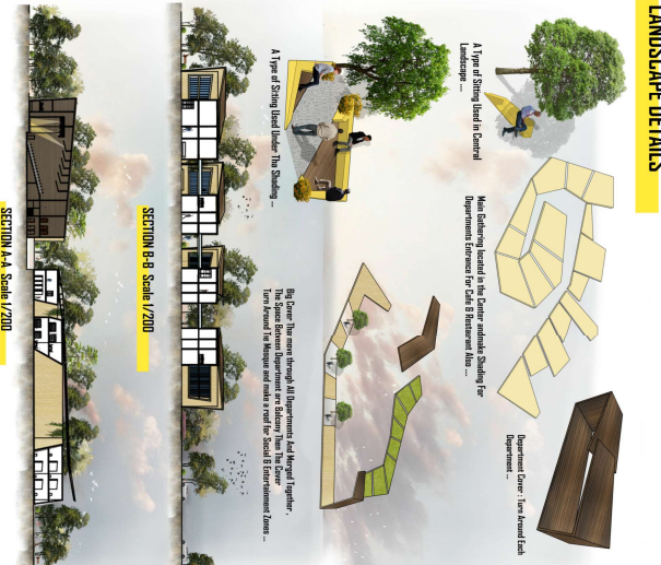
SECTION A-A Scale 1/200