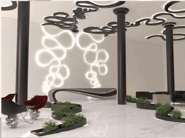
1. FRONT DESK

CONCEPT I took my concept from ARTERIES.