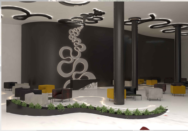
2. LOBY BAR