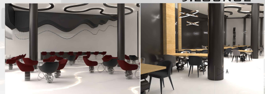
8. COFFEE SHOP