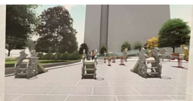
view 1 playground