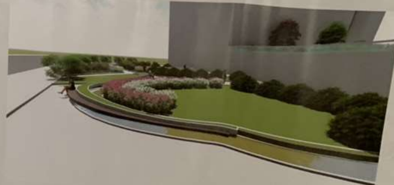
view 3 water feature (mall)