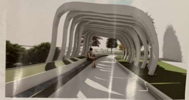
view 2 shelter